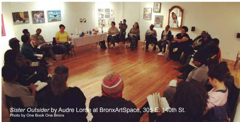
Sister Outsider by Audre Lorde at BronxArtSpace, 305 E. 140th St.