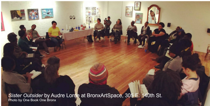
Sister Outsider by Audre Lorde at BronxArtSpace, 305 E. 140th St.